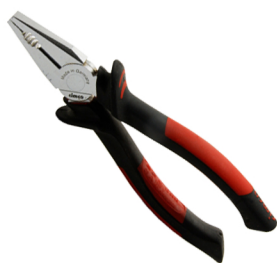
1 X PLIERS