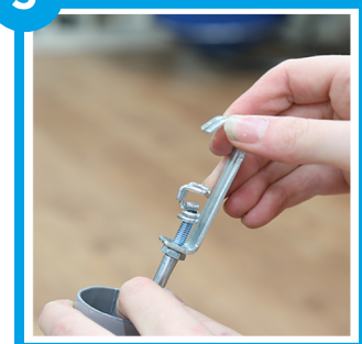
Screw the hook to follow the nut