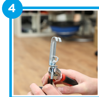
Screw the nut under the tension cable counterclockwise down the thread