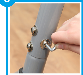
Slot the handlebar post back in place making sure not to catch the wires