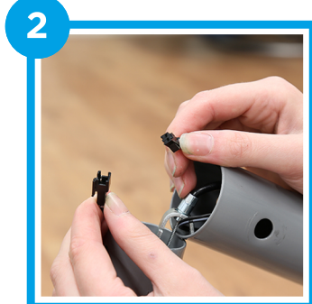
Disconnect the sensor wires