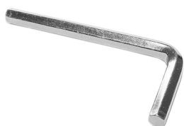
1 X ALLEN KEY