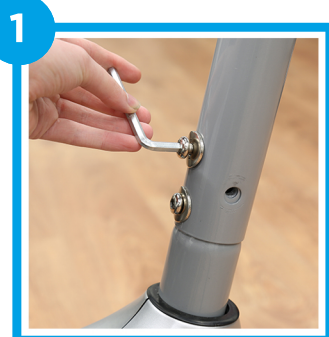
Start by removing the handlebar post