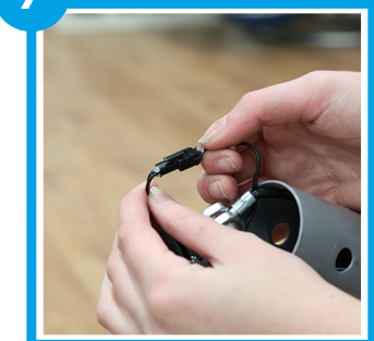
Reconnect the sensor wires