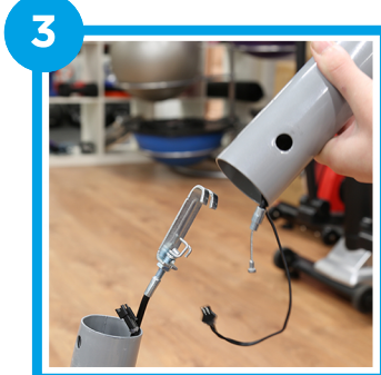
Unhook the tension cable